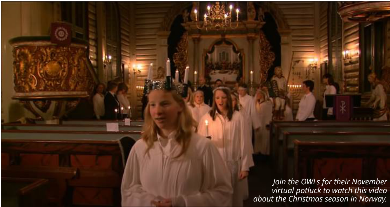
Join the OWLs for their November virtual potluck to watch this video about the Christmas season in Norway.