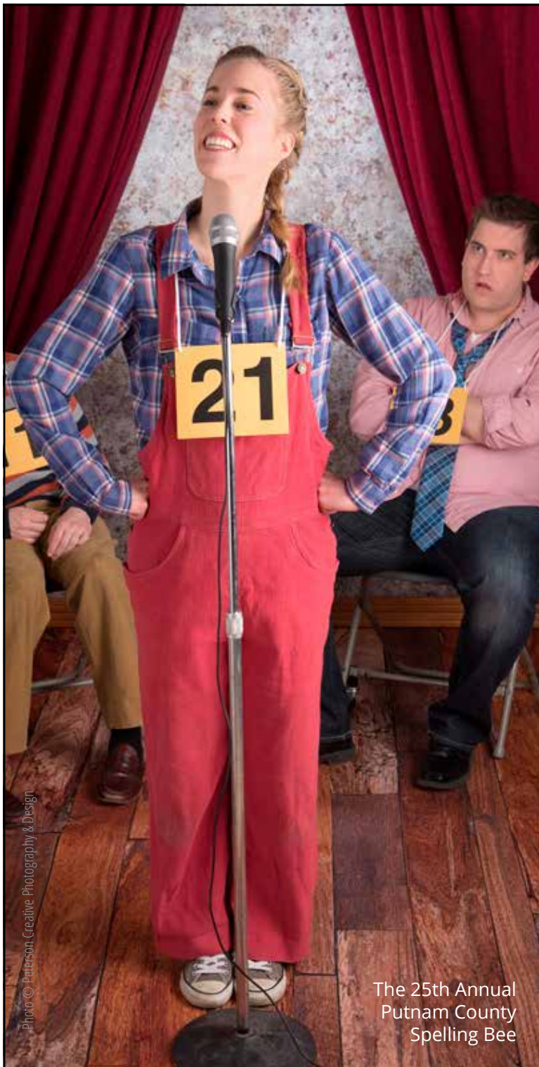
The 25th Annual Putnam County Spelling Bee