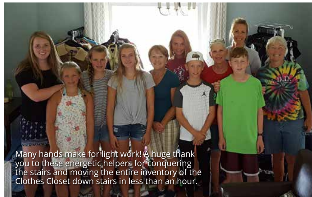
Many hands make for light work! A huge thank you to these energetic helpers for conquering the stairs and moving the entire inventory of the Clothes Closet down stairs in less than an hour.

This year, thanks to the continuing generosity of our congregation and a grant from the Franke Foundation, the First Teen Clothes Closet again